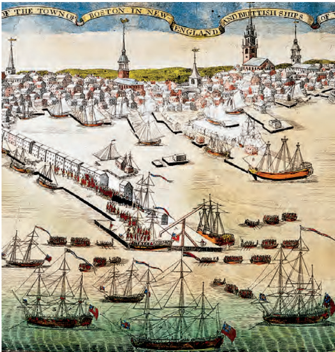
Redcoats Landing in Boston

Nonimportation agreements, previously potent, were quickly revived against the Townshend Acts. But they proved less effective than those devised against the Stamp Act. The colonists, again enjoying prosperity, took the new