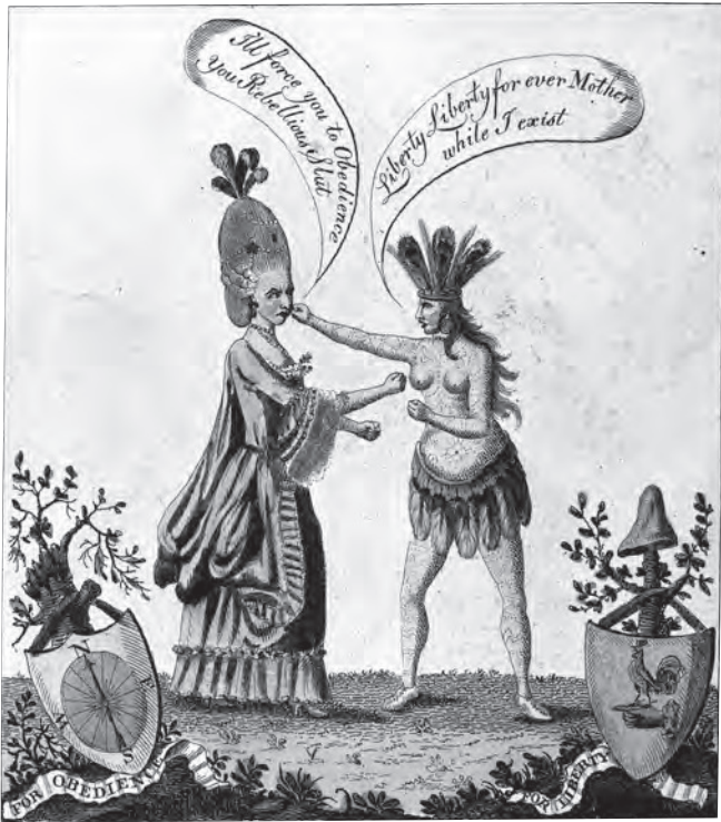
The Female Combatants, 1776 Britain is symbolized as a lady of fashion; her rebellious daughter, America, as an Indian princess. Their shields of Obedience and Liberty seem mutually exclusive standards.

coins, mostly earned in illicit trade with the Spanish and French West Indies, drained out of the colonies, creating an acute money shortage. To facilitate everyday purchases, the colonists resorted to butter, nails, pitch, and feathers for purposes of exchange.