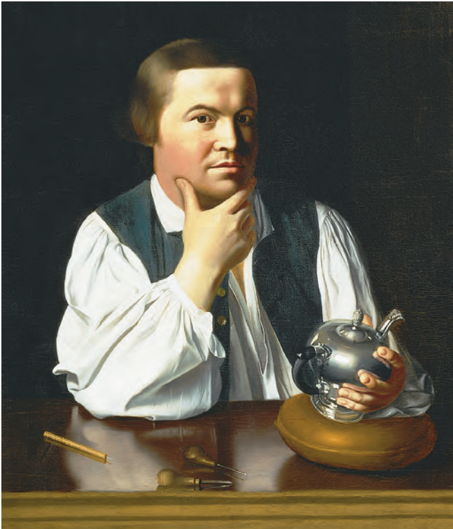
Paul Revere, by John Singleton Copley, c. 1768 This painting of the famed silversmith-horseman challenged convention—but reflected the new democratic spirit of the age—by portraying an artisan in working clothes. Note how Copley depicted the serene confidence of the master craftsman and Revere’s quiet pride in his work.

We have an old mother that peevish is grown; She snubs us like children that scarce walk alone; She forgets we’re grown up and have sense of our own.