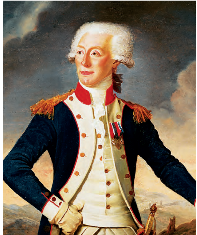
Gilbert du Motier, Marquis de Lafayette (1757–1834), by Joseph Boze, 1790 This youthful French officer gave to America not only military service but some $200,000 of his private funds. He returned to France after the American Revolution to play a conspicuous role in the French Revolution.

Economic difficulties were nearly insuperable. Metallic money had already been heavily drained away. A cautious Continental Congress, unwilling to raise