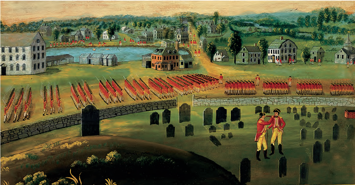
A View of the Town of Concord, c. 1775 Redcoats here drill on the Concord Green, near where colonial militiamen would soon repel their advance on stores of rebel gunpowder.

George Washington dined at his own lodgings only nine times.