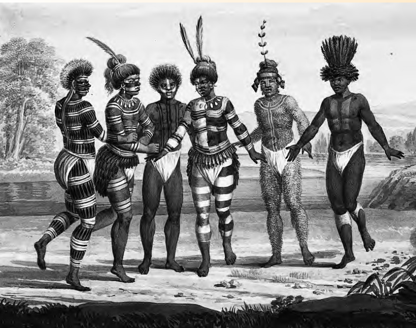
California Indians Dancing at the Mission in San José, by Sykes, 1806

lucrative foreign trade. The frocked friars had commanded their fiefdoms so self-confidently that earlier reform efforts had dared to go no further than levying a paltry tax on the missions and politely requesting that the missionaries limit their floggings of Indians to fifteen lashes per week. But during the 1830s, the power of the missions weakened, and much of their land and their assets were confiscated by the Californios. Vast ranchos (ranches) formed, and from those citadels the Californios ruled in their turn until the Mexican War.