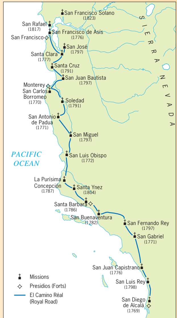
Spanish Missions and Presidios

By 1870 the Californios' brief ascendancy had utterly vanished—a short and sad tale of riches to rags