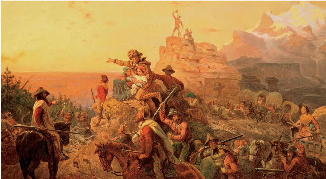
Westward the Course of Empire Takes Its Way This romantic tribute to the spirit of Manifest Destiny was commissioned by Congress in 1860 and may still be seen in the Capitol.

signed the joint resolution three days before leaving the White House.