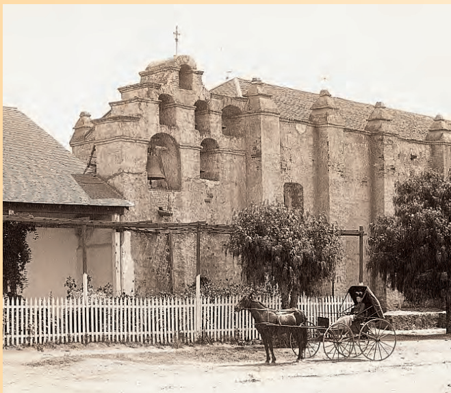
Mission San Gabriel, Founded in 1771

Mexico now emptied its jails to send settlers to the sparsely populated north, built and garrisoned fortresses, and, most important, transferred authority from the missions to secular (that is, governmental) authorities. This “secularization” program attacked and eroded the immense power of the missions and of their Franciscan masters—with their bawling herds of cattle, debased Indian workers, millions of acres of land, and