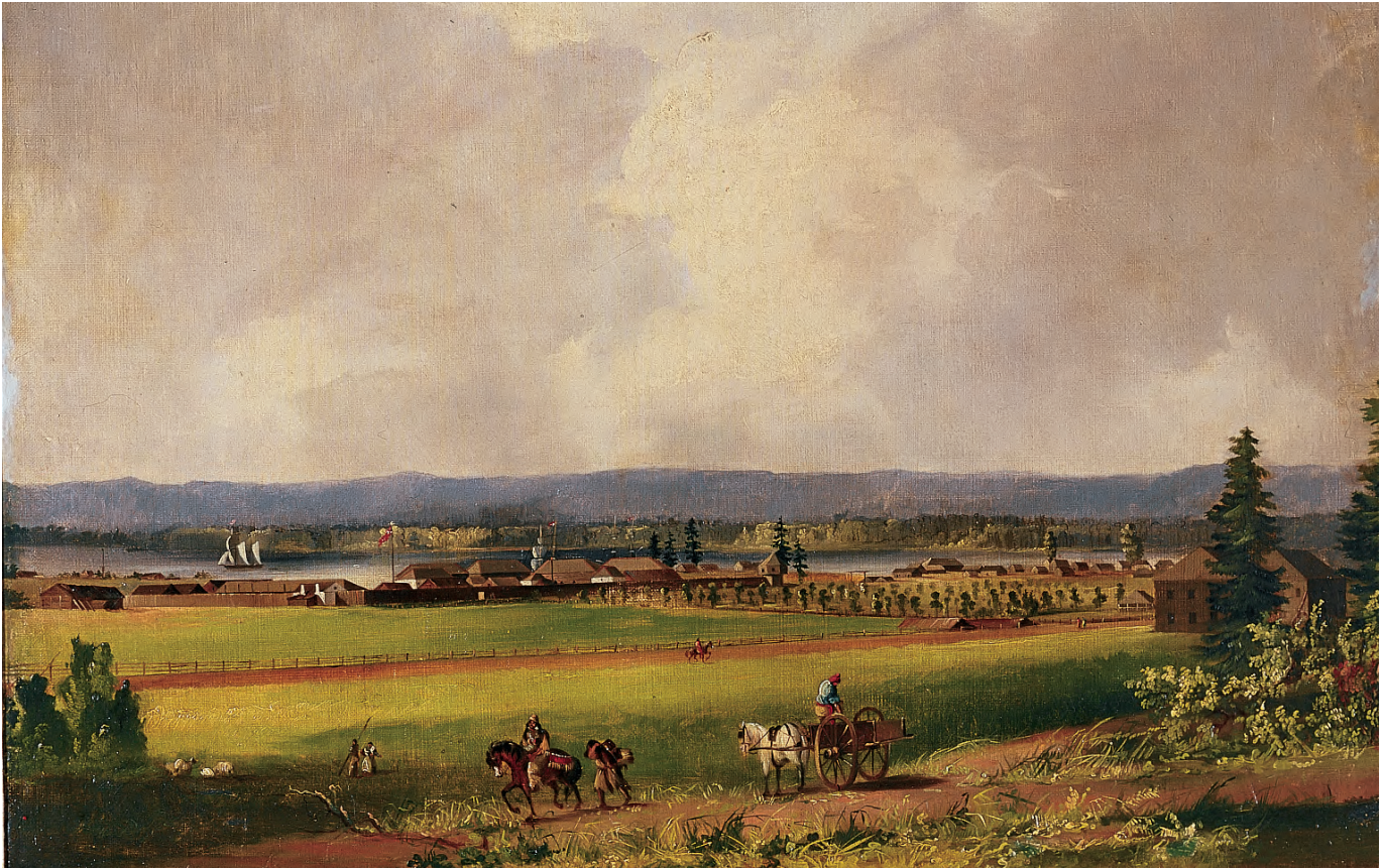
Fort Vancouver, Oregon Country, c. 1846 Fort Vancouver, on the Columbia River near its confluence with the Willamette River (see the map on p. 381), was the economic hub of the Oregon Country during the early years of settlement. Founded as a Hudson’s Bay Company fur-trading outpost, the fort was handed over to the Americans when Britain ceded the Oregon Country to the United States in 1846.

day seize the Oregon Country. Why fight a hazardous war over this wilderness on behalf of an unpopular monopoly, the Hudson’s Bay Company, which had already “furred out” much of the area anyhow?