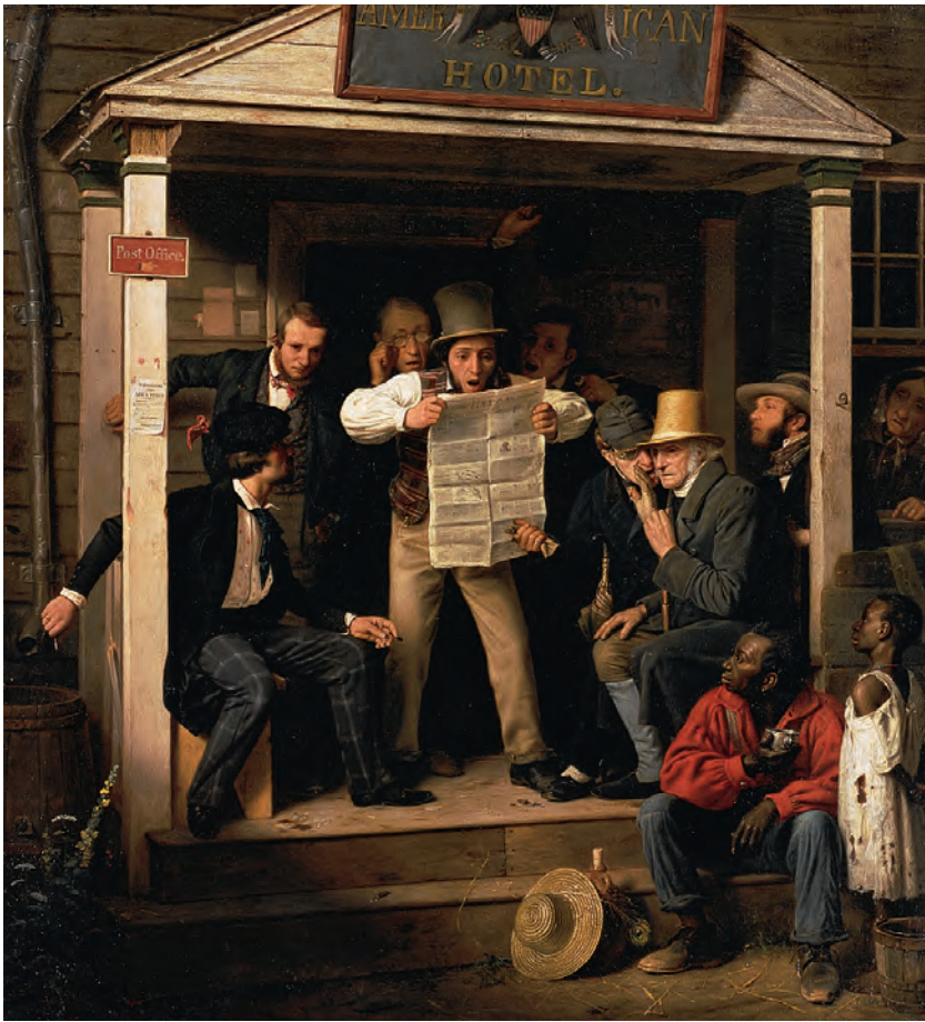
War News from Mexico, by Richard Caton Woodville The newfangled telegraph kept the nation closely informed of events in far-off Mexico.

vexatious policing problem. Farseeing southerners like Calhoun, alarmed by the mounting anger of antislavery agitators, realized that the South would do well not to be too greedy. The treaty was finally approved by the Senate, 38 to 14. Oddly enough, it was condemned both by those opponents who wanted all of Mexico and by opponents who wanted none of it.