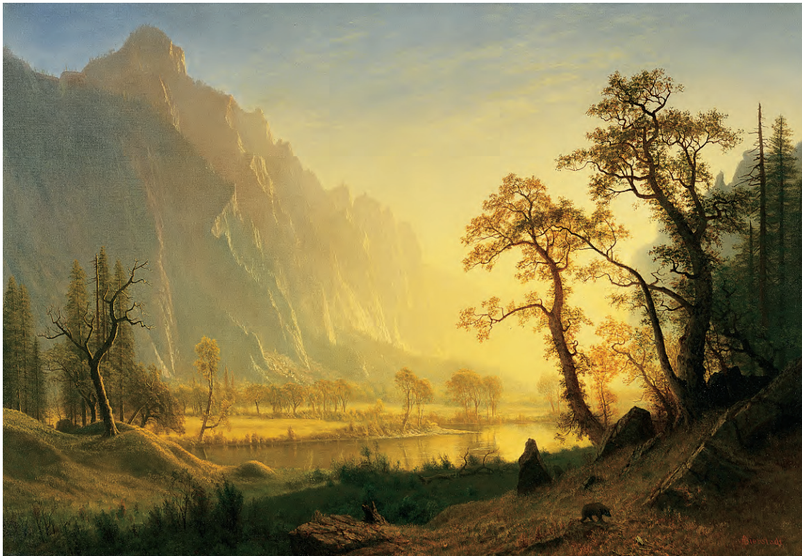
Sunrise, Yosemite Valley, by Albert Bierstadt, c. 1870 A German-born artist, Bierstadt romanticized the already awesome beauty of the American West.

held inviolable by the civilizing hand of humanity. But other conservationists, among them President Roosevelt’s chief forester, Gifford Pinchot, believed that