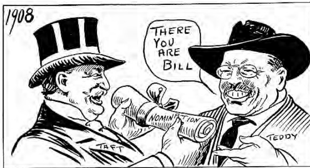
Roosevelt the Take-Back Giver