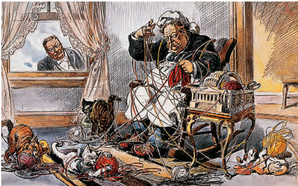
Ex-President Theodore Roosevelt Watches President Taft Struggle with the Demands of Government, 1910

Though ordinarily lethargic, Taft bestirred himself to use the lever of American investments to boost American political interests abroad, an approach to foreign policy that his critics denounced as “dollar diplomacy.” Washington warmly encouraged Wall Street bankers to sluice their surplus dollars into foreign areas of strategic concern to the United States, especially in the Far East and in the regions critical to the security of the Panama Canal. By preempting investors from rival powers, such as Germany, New York bankers would thus strengthen American defenses and foreign policies, while bringing further prosperity to their homeland—and to themselves. The almighty dollar thereby supplanted the big stick.