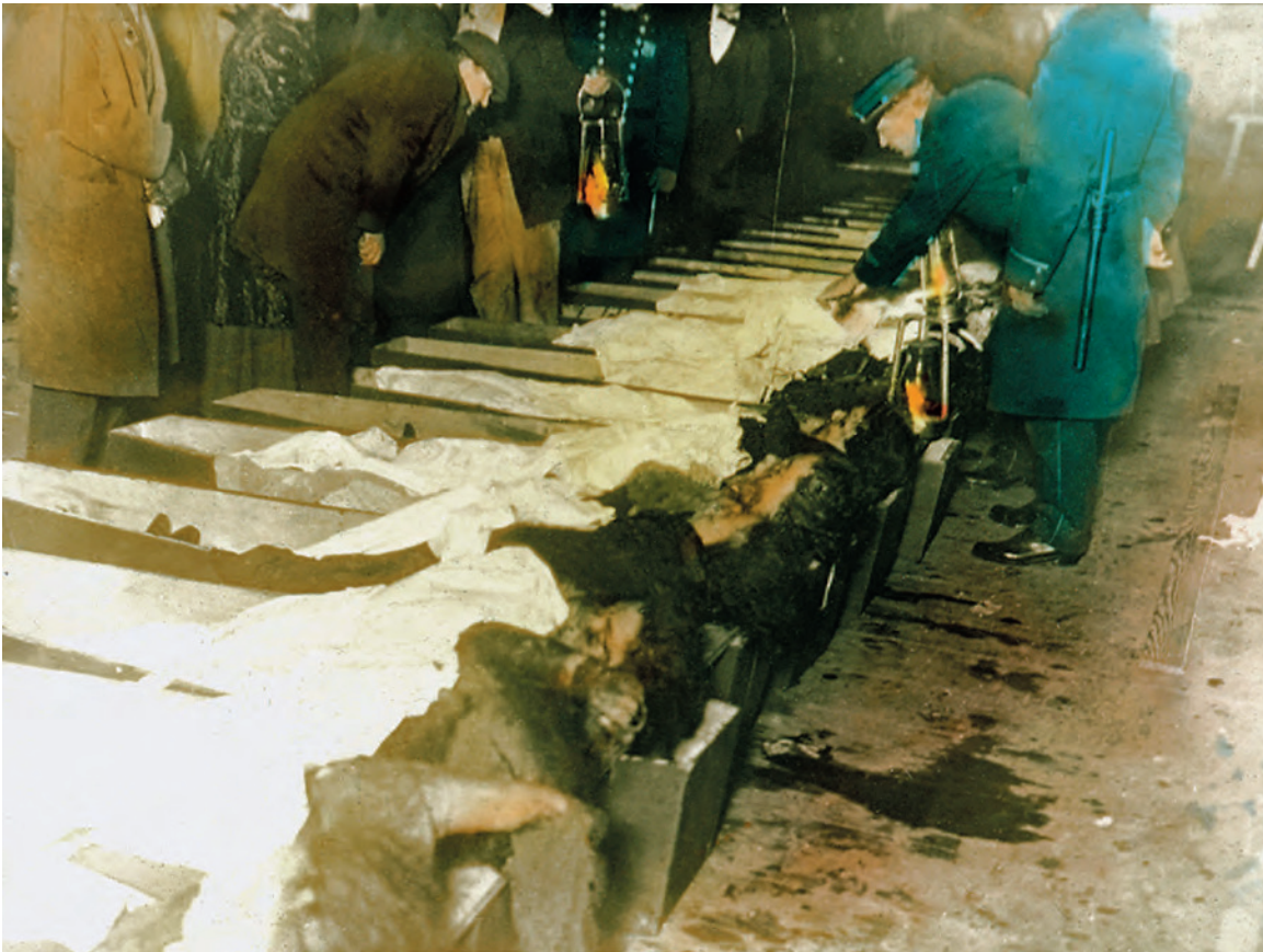
The Wages of Negligence Officials review the charred remains of some of the survivors of the catastrophic Triangle Shirtwaist Company fire in 1911. Outrage over this calamity galvanized a generation of reformers to fight for better workplace safety rules.

stronger laws regulating the hours and conditions of sweatshop toil. Other legislatures followed, and by 1917 thirty states had put workers' compensation laws on the books, providing insurance to workers injured in industrial accidents. Gradually the concept of the employer's responsibility to society was replacing the old dog-eat-dog philosophy of unregulated free enterprise.