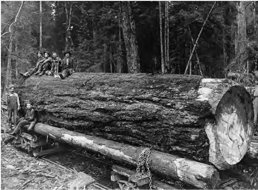
Loggers in the State of Washington, 1912 It took the sweat and skill of many men to conquer a giant Douglas fir like this one. An ax-wielding “sniper” had rounded the edges of this log so that a team of oxen, driven by a “bullwhacker,” could more easily drag it out of the woods along a “skid road.” Skid road (sometimes corrupted as skid row ) was also a name for the often-sleazy sections of logging towns, where loggers spent their time in the off-season.

ronmentalists,” pp. 670–671). Huntsman, naturalist, rancher, lover of the great outdoors, he was appalled by the pillaging of timber and mineral resources. Other dedicated conservationists, notably Gifford Pinchot, head of the federal Division of Forestry, had broken important ground before him. But Roosevelt seized the banner of leadership and charged into the fray with all the weight of his prestige, his energy, his firsthand knowledge, and his slashing invective.