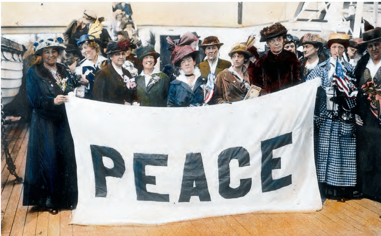
Jane Addams and Fellow Pacifists, 1915 Addams cofounded the Women's Peace party in 1915. Its pacifist platform was said to represent the views of the "mother half of humanity." Although the party initially attracted twenty-five thousand members, America's entry into the war two years later eroded popular support, as pacifist internationalism became suspect as anti-American.

Laws regulating factories were worthless if not enforced, a truth horribly demonstrated by a lethal fire in 1911 at the Triangle Shirtwaist Company in New York City. Locked doors and other flagrant violations of the fire code turned the factory into a death trap. One hundred forty-six workers, most of them young immigrant women, were incinerated or leapt from eighth- and ninth-story windows to their deaths. Lashed by the public outcry, including a massive strike by women in the needle trades, the New York legislature passed much