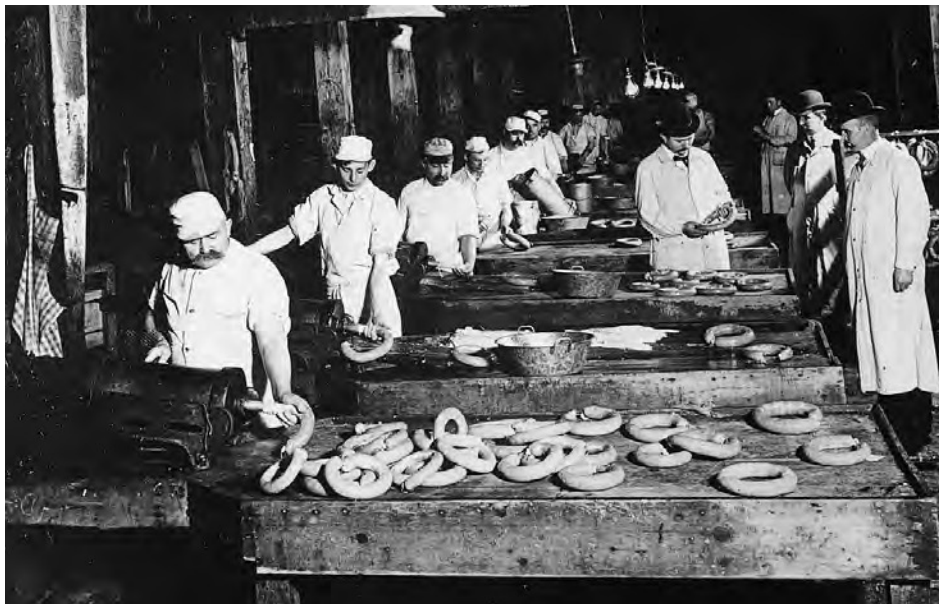
Sausage Making, c. 1906 White-jacketed inspectors like those on the right made some progress in cleaning up the septic slaughterhouses after the passage of the Meat Inspection Act in 1906.

At the same time, American consumers hungered for safer canned products. Their appetite for reform was whetted by Upton Sinclair's sensational novel The Jungle , published in 1906. Sinclair intended his revolting tract to focus attention on the plight of the workers in the big canning factories, but instead he appalled the public with his description of disgustingly unsanitary food products. (As he put it, he aimed for the nation's heart but hit its stomach.) The book described in noxious detail the filth, disease, and putrefaction in Chicago's damp, ill-ventilated slaughterhouses. Many readers, including Roosevelt, were so sickened that for a time they found meat unpalatable. The president was moved by the loathsome mess in Chicago to appoint a special investigating commission, whose cold-blooded